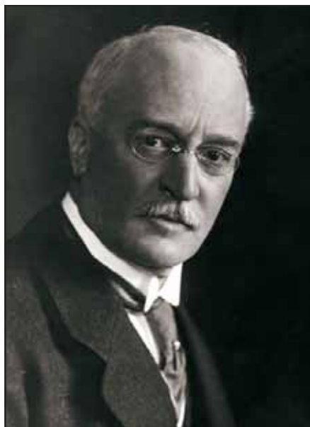
Figure 2 Rudolph Diesel

The amazing thing about ASTM D975-97 is the lack of actual requirements for the fuel specifications. They mention flash point, water and sediment percentages, viscosity, carbon, ash and sulfur percentages and cetane minimums. They never mention the actual composition of the fuel or the source from which it is derived. I have often wondered if Rudolf Diesel's peanut powered machine was the reason for these regulations or lack of regulations.