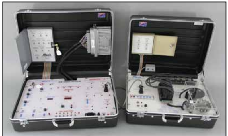
GM OBD II Suitcase Trainer connected to C 3 I Ignition Suitcase Trainer