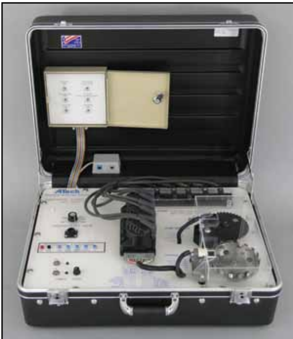
GM C 3 I Suitcase Model 1771SF